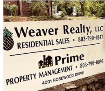
The Weaver Realty team and Prime Financial Services is a certified Business Friend of the Sherwood Forest Neighborhood Association.

Join us at the Sherwood Forest ARP Church from 6:30 – 7:30 pm or on Zoom. Door opens by 6pm to allow for set up and collaboration. Please bring a snack to share. Click here for the meeting agenda.