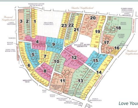
Love Your Forest.